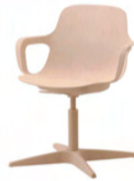
1. Ikea - Odger Swivel Chair