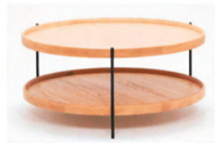
3. EQ3 - Sage Round Coffee Table in Oak