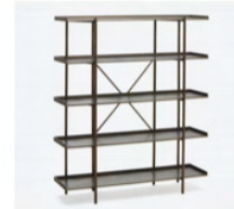
2. Structube - Ross