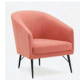
Lounge Chair Structube - Cati Chair